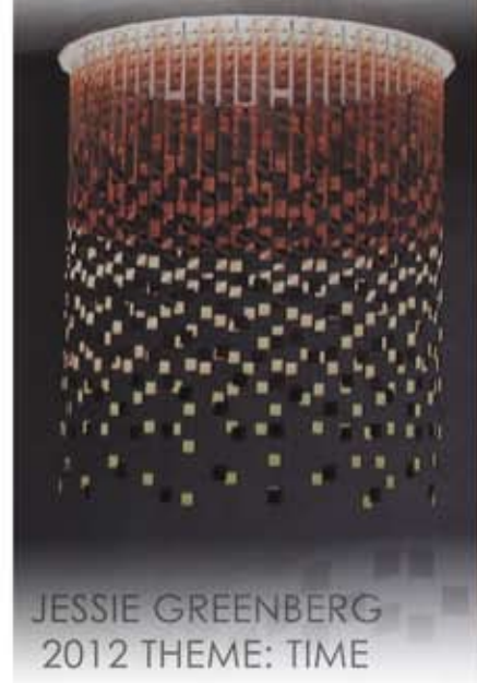
JESSIE GREENBERG 2012 THEME: TIME